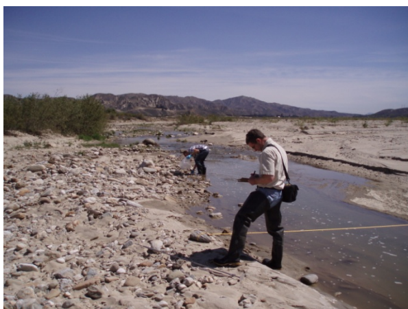
Figure 4. SCR Up