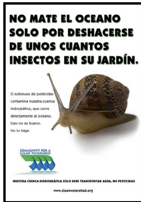
Spanish Language Pesticide Outreach

Watershed Protection Tip pamphlets aimed at residents were created to encourage best practices in their homes. These brochures were distributed to targeted retail stores to reach the population that is likely involved in the activities. The colorful pamphlet defines the Watershed, explains the storm drain system, how polluted water is damaging and gives both overall and topic-specific tips for how to keep the Watershed clean. In this case the one aimed at gardeners talks about plant selection, irrigation, fertilizer and pesticide practices, integrated pest management and proper yard maintenance.