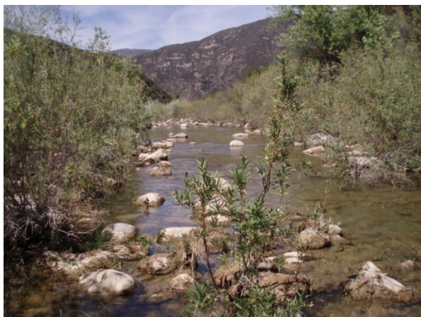
Figure 2. VR Up