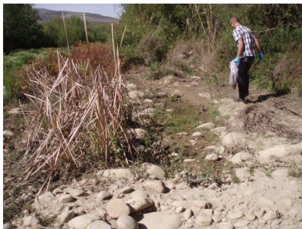
Figure 3. VR Down