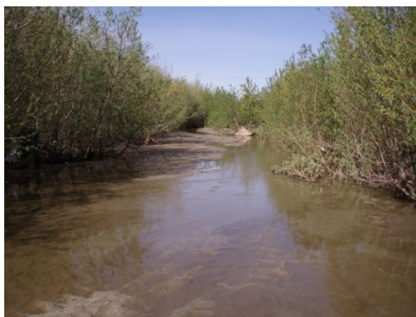
Figure 5. SCR Down

As described in the Ventura County MS4 Pyrethroid Insecticides Monitoring Quality Assurance Project Plan (QAPP), the top layer (~1 cm) of recently deposited sediment was collected with a pre-cleaned stainless steel scoop as specified in the permit. The quantity of sediment required for the tests precluded sampling directly into glass jars, so the sediment was deposited in a 24" by 36" 2mm polyethylene bag per site. The bag was closed and the sediment was manually homogenized onsite by squeezing and rotating the bag. Homogenized sediment was placed in two 8 oz wide-mouth glass jars and placed on ice for TOC and pyrethroid analysis. The jars were placed in the freezer at the end of the sampling day so that they could be frozen for pickup by the chemistry lab courier the following day. The remaining sediment (~ 3 liters) was double-bagged and put on ice for (same day) delivery to the toxicity lab.